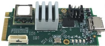
Thunderbolt™ 3/USB-C I/O Card